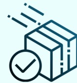
Assembly/ Production Workers